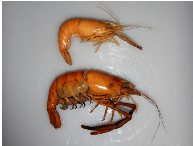
Fig. Macrobrachium minispinata sp. nov. - Holotype male 71.5 mm total length; allotype berried female 96.5 mm, collected from South Andaman.