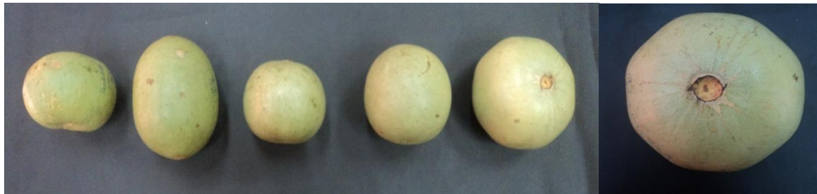
Plate : Variations in fruit size and shape amongst the bael collections (left) and a type showing octagonal fruit shape (right)

Bael ( Aegle marmelos ) is one of the important fruit crops, possessing plethora of medicinal properties in it. Fruits are commonly consumed by local people in the form of fresh fruits or made into juice. Being seedling progenies considerable diversity is noticed in the available populations in the Islands. In order to identify superior types, explorations were carried out in South Andaman and North and Middle Andaman districts of the Islands. Twenty four types were identified based on morphological parameters of the tree, leaves and fruits from different areas such as Kalipur, Durgapur, Kalighat, Ramnagar No. 1, Ramnagar No. 2, R.K. Gram, Govindpur No. 3, Badam Nallah, Basantipur, Chitrakoot, Panchawati, Nimbutala and Kodyaghat. Considerable diversity was observed for fruit size and shape. A type with octagonal shape was also observed in the collections. Leaves and mature fruits (wherever available) were collected and are being analysed for various parameters based on DUS guidelines for the crop.