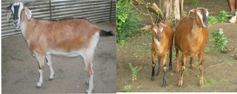
Plate : Adult Teressa goat male and female