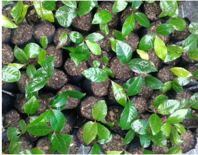
Plate : Collections of Horsfieldia glabra , M. andamanica and Knema andamanica