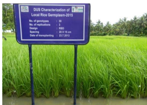
Fig.1 A field view of rice crop at Bloomsdale Research Farm during Kharif 2015