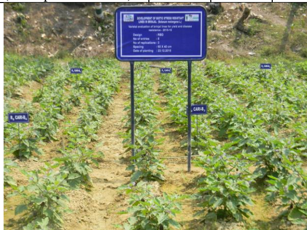
Fig.: A Field view of Bacterial wilt resistant brinjal lines at Bloomsdale Farm.