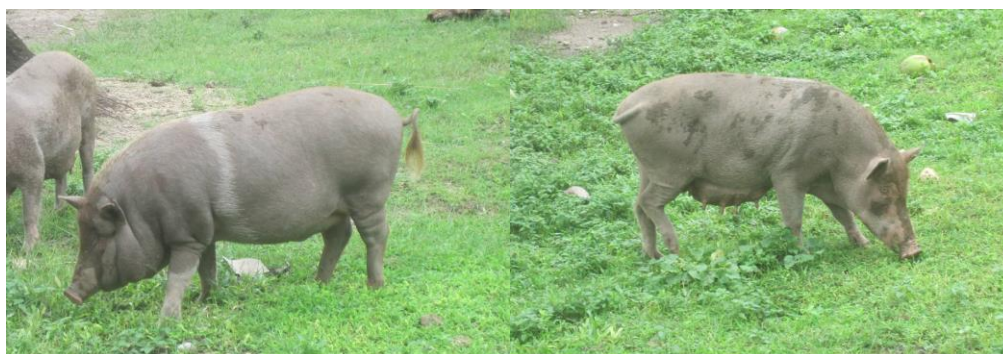
Plate : Adult Nicobari pig male and female