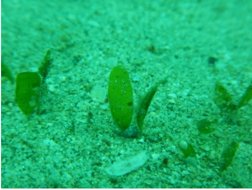
Fig. Halophila decipiens