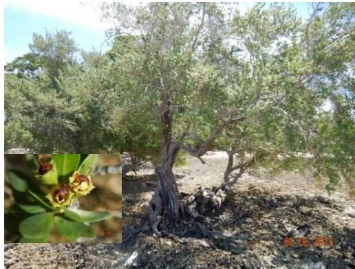
Fig. Pemphis acidula tree and inflorescence (inset)