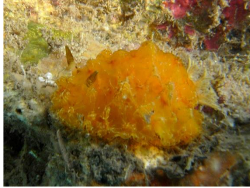
Fig. Halgerda dalanghita Fahey & Gosliner, 1999