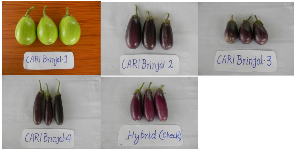
Fig.: Variability in fruit shape and colour among wilt resistant brinjal lines