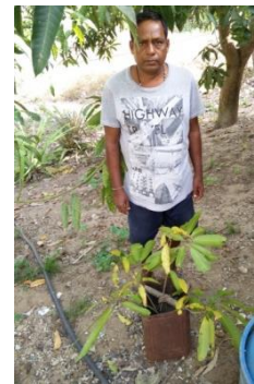
Polyembryonic nature of blue mango